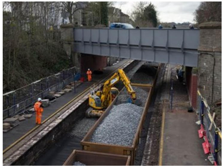
New stone will be unloaded onto the track

Please note that dates and times of work may be subject to change, Our work will involve heavy machinery which can be noisy — we are sorry for any inconvenience.